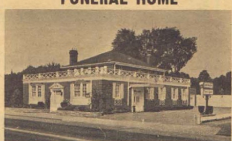
FIVE HUNDRED WEST NINE MILE