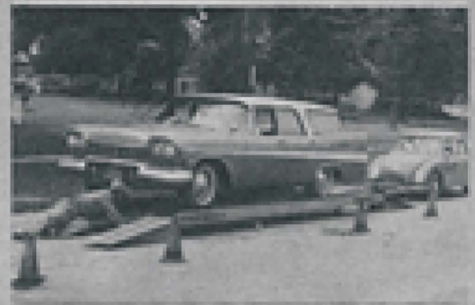
Safety vehicle check program sponsored by Exchange - Kiwanis - Rotary Clubs of Ferndale.