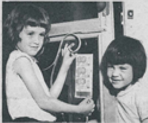
Traffic safety begins at home