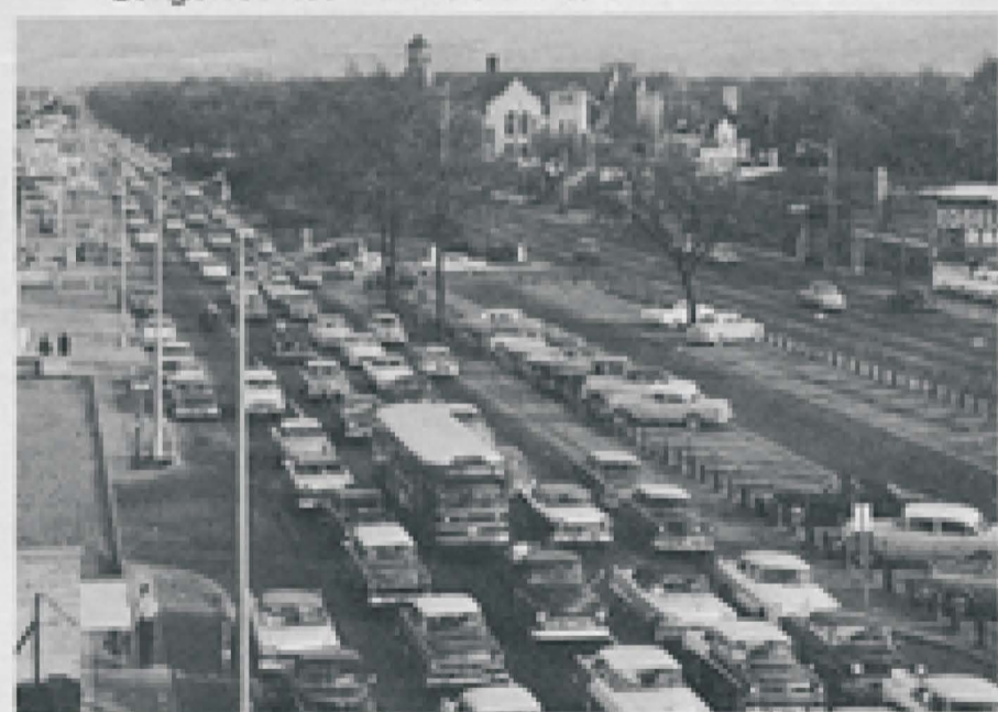
Heavily traveled U.S. 10 (Woodward Ave.)