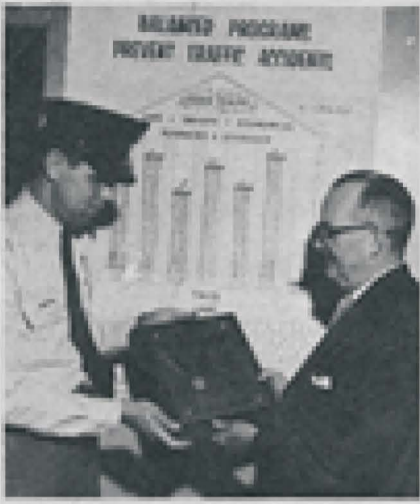
Official recognition given to city for balanced traffic safety program.