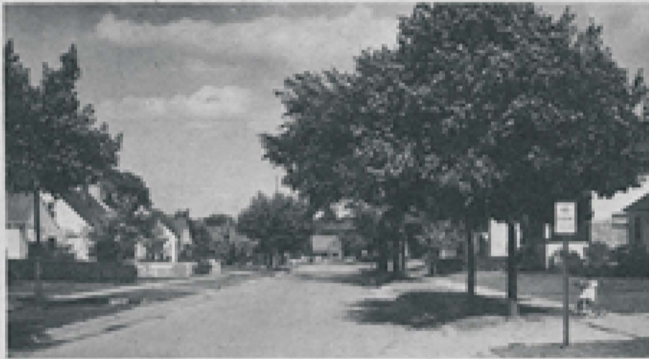
Our Goal - Clear Streets - Most children injured due to running into the street from between parked cars.