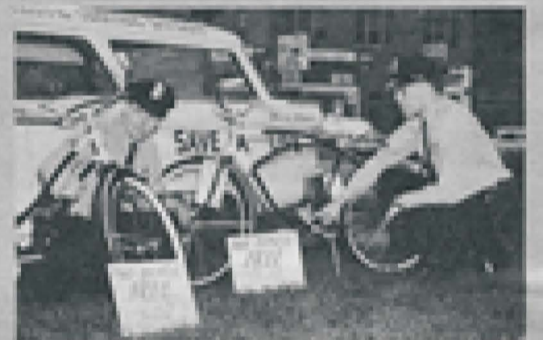
Bicycle contests simulate interest for safety among youngsters.