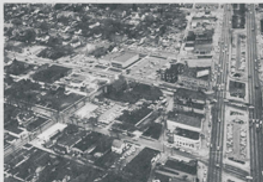
The many complexes of Ferndale add to traffic problems.