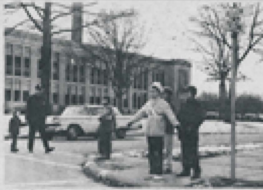
Safety Patrol Boys are a valuable part of child safety in Ferndale.