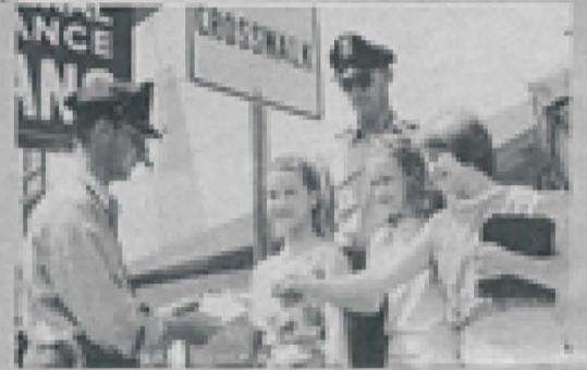
Pedestrian safety programs alert the public to traffic hazards.