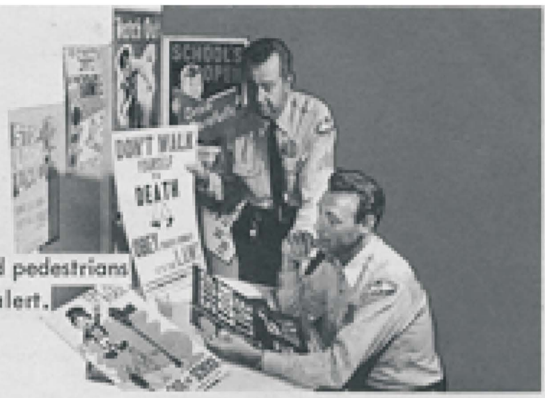
Safety posters remind pedestrians and motorists to be alert.