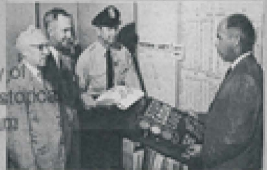
Organized traffic safety activities produce results.